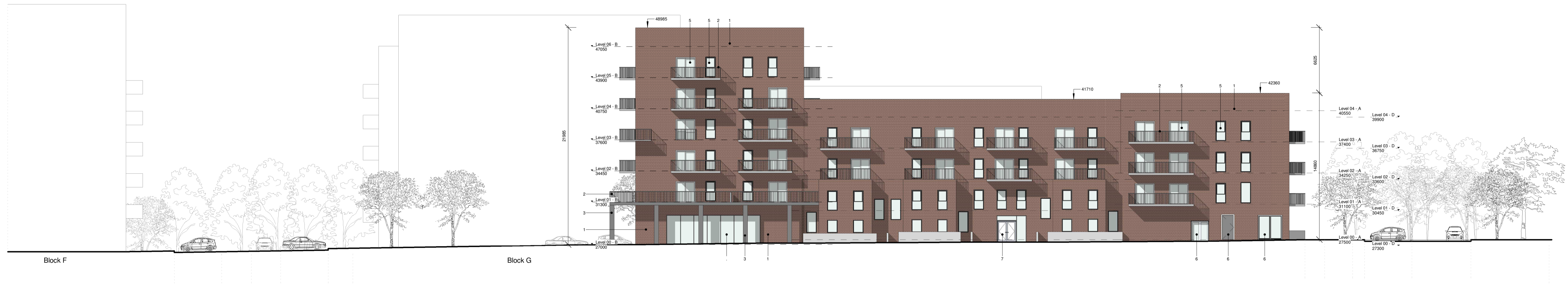
1 Block E - Elevation North 1 : 200