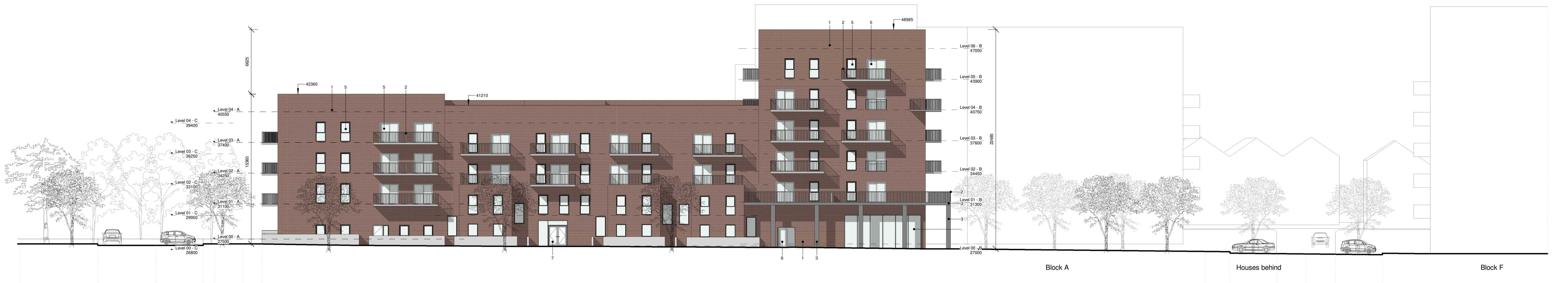
2 Block E - Elevation South 1 : 200